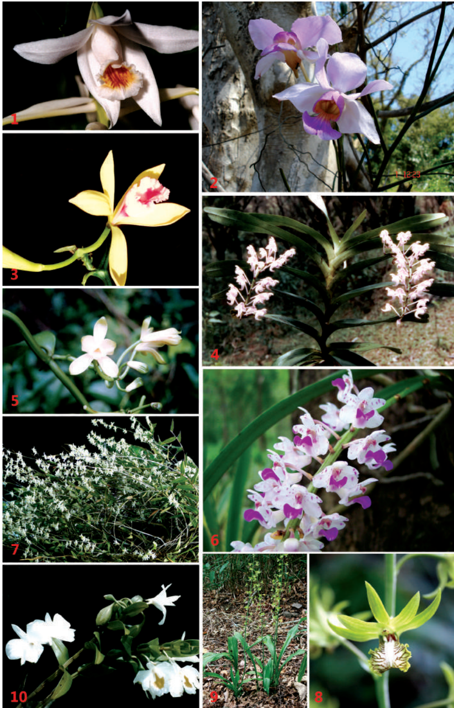
Fig. 7. Andaman – Nicobar orchids at JNTBGRI. 1. Thunia alba 2. Papilionanthe teres 3. Vanilla andamanica 4. Aerides emericii 5. Vanilla sanjappae 6. Rhynchostylis retusa 7. Dendrobium crumenatum 8. & 9. Eulophia andamanensis 10. Dendrobium formosum