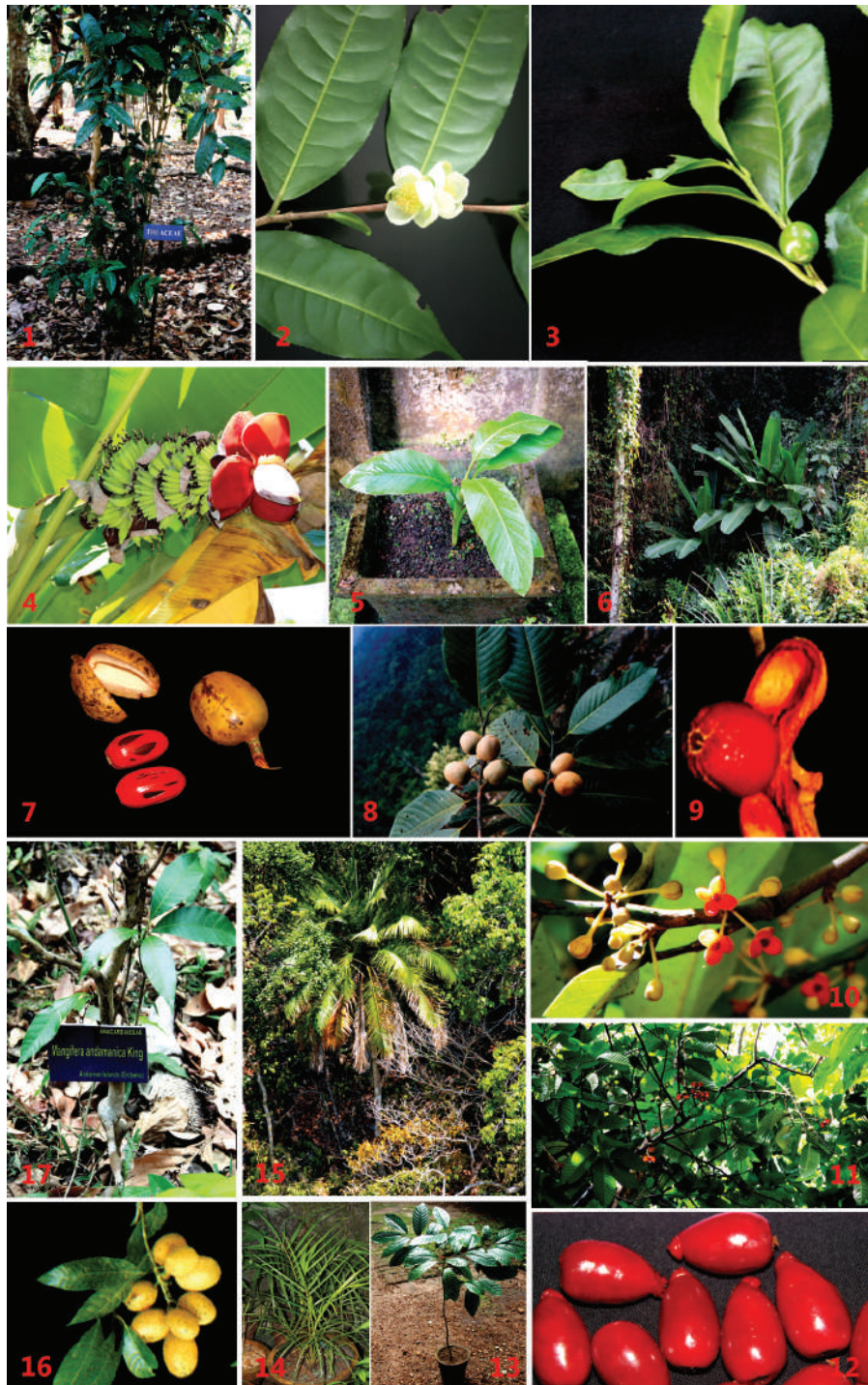
Fig. 4. 1-3. Camellia kissii (habit, flowers & fruit) at Field Gene Bank (JNTBGRI). 4. Musa sabuana – A wild endemic plantain from South Andaman. 5. Musa sabuana – A tiller at Field Gene Bank (JNTBGRI). 6. Musa balbisiana var. andamanica – Another wild endemic from Middle Andaman. 7 & 8. Myristica andamanica – An endemic wild nutmeg (Aril & Fruits). 9 & 10. Knema andamanica – An endemic wild relative of nutmeg - Aril, Fruits & Flowers(Field Gene Bank , JNTBGRI). 11, 12 & 13 Endocomia macrocoma ssp. prainii - An endemic wild relative of nutmeg at Field Gene Bank, JNTBGRI (Habit, Aril & Seedling).14. A seedling of Phoenix andamanensis - An endemic wild date palm at Field Gene Bank, JNTBGRI. 15. Phoenix andamanensis at Kalpong forest (North Andamans). 16. Mangifera andamanica – An endemic wild mango from South Andamans. 17. Mangifera andamanica – A seedling at Field Gene Bank, JNTBGRI.