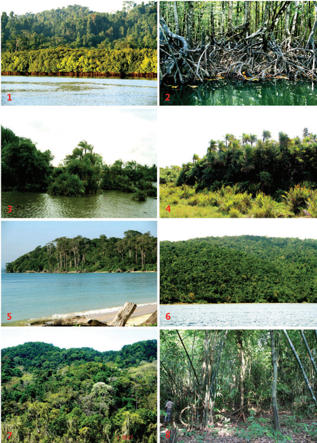
Fig 1. Mangrove vegetation at Baratang Island 2. Mangrove root system of Bruguiera gymnorhiza – A red listed mangrove species by IUCN (nursery ground for several arthropods) 3 & 4 Sub-tidal forests with Phoenix paludosa and Acrostichum aurum (two dominant species of sub-tidal forests) 5. Littoral Forests at Wandoor Marine National Park.6. A view of Evergreen Forests of Mount Harriet from sea.7. Semi Evergreen Forests at Wright Myo. 8. Bamboo Brake ( Gigantochloa andamanica ) at Diglipur.