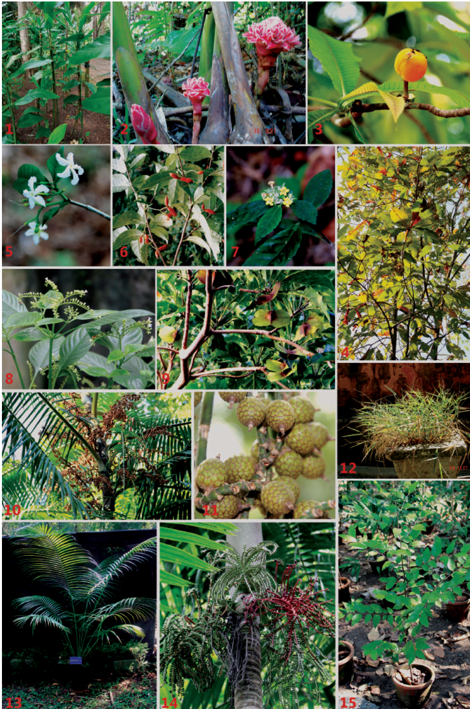
Fig. 8. Andaman – Nicobar endemics at Field Gene Bank, JNTBGRI. 1. & 2. Etilingera fenzlii – Honey bee repellent species. 3. & 4. Dillenia andamanica 5. & 6. Tabernaemontana crisa 7. Strobilanthes sanjappae 8. Ophiorrhiza infundibularis 9. Terminalia bialata 10. & 11. Calamus andamanicus 12. Oryza indandamanica 13. Rophaloblaste augusta 14. Pinanga andamanensis 15. Diospyros marmorata (Marble wood).