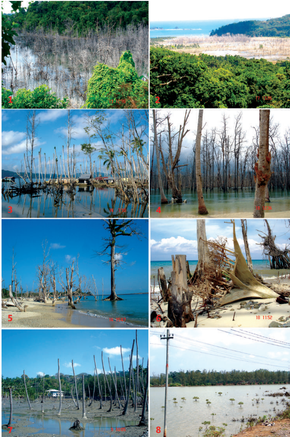
Fig. 6. 1. Lost mangrove vegetation at Nancoverly Island after tsunami in 2004 (Photograph in 2010). 2. Lost mangrove vegetation at Great Nicobar Island after tsunami in 2004 (Photograph in 2010). 3, 4, 5 & 6 Coastal regions of Campbell Bay in 2010. 7. Coastal region at Bambooflat, Port Blair after tsunami in 2010. 8. Coastal region at Garachrma, South Andaman after tsunami in 2010 (gradual succession of mangrove species).