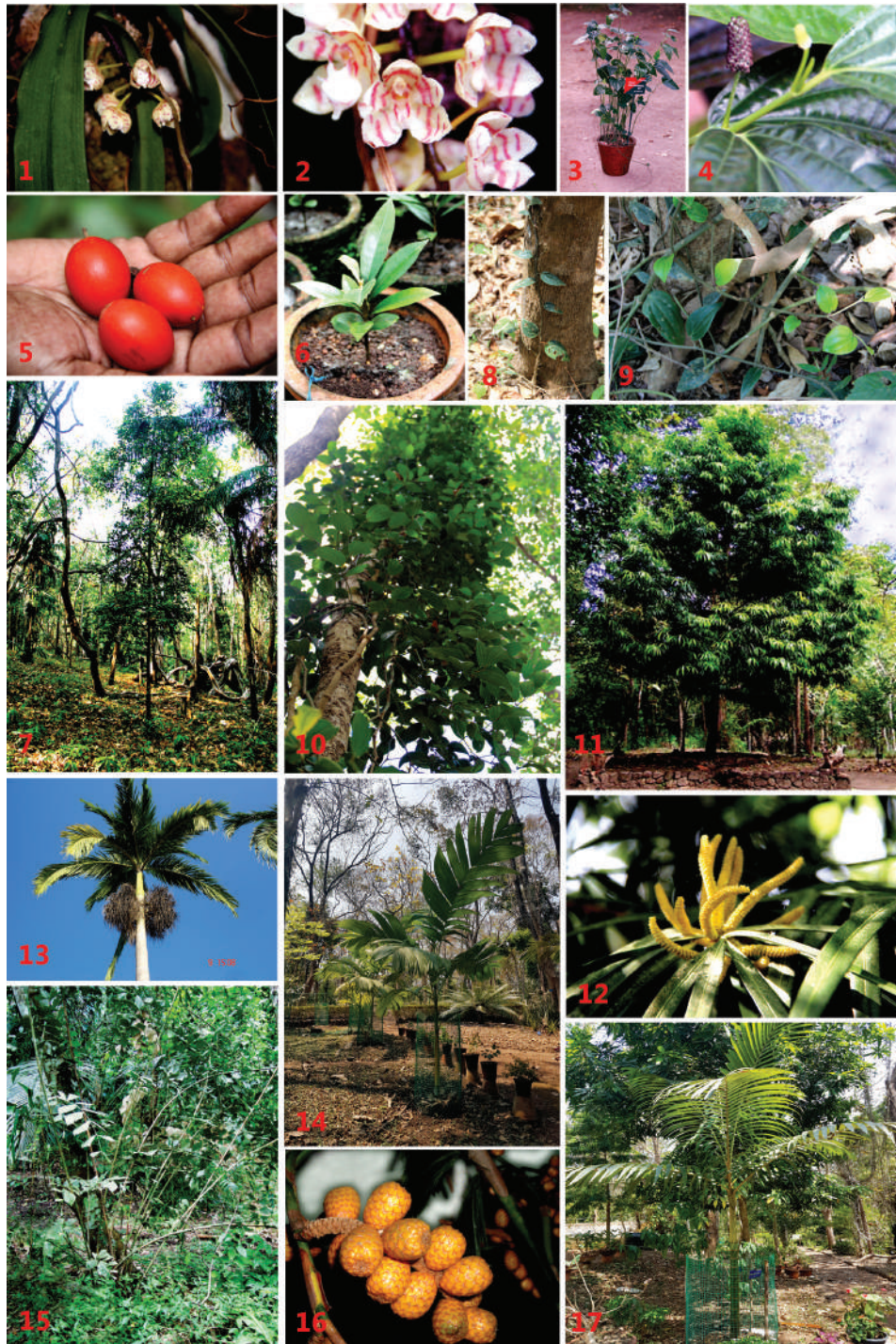
Fig. 5. 1 & 2. Pteroceras muriculatum (endemic orchid)– A rediscovery after a century at Field Gene Bank, JNTBGRI. 3 & 4. Piper sarmentosum at Field Gene Bank, JNTBGRI – An extinct species after tsunami from its insular natural habitat. 5 6 & 7. Mimusops andamanensis – IUCN red listed endemic (A&N Isl & Sri lanka) – A rediscovery after a century at Field Gene Bank, JNTBGRI. 8, 9 & 10. Piper ribesioides – A woody piper rediscovered from Wright Myo after 150 years at Field Gene Bank, JNTBGRI. 11 & 12. Podocarpus neriifolius – A red listed gymnosperm by IUCN at Field Gene Bank, JNTBGRI. 13. Bentinckia nicobarica at Katchal Island. 14. Bentinckia nicobarica - A red listed gymnosperm by IUCN at Field Gene Bank, JNTBGRI. 15 & 16 Korthalsia rogersii – A rediscovery after a century from South Andamans at Field Gene Bank, JNTBGRI (Fruits & Plant). 17. Pinanga andamanensis - A rediscovery after a century at Field Gene Bank, JNTBGRI.